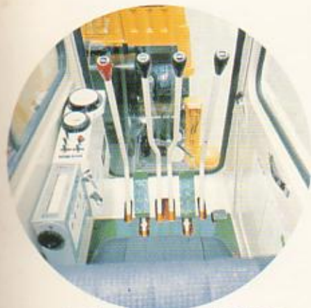
• The heater is an optional part.