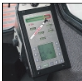
Mechanical boom angle indicator - standard