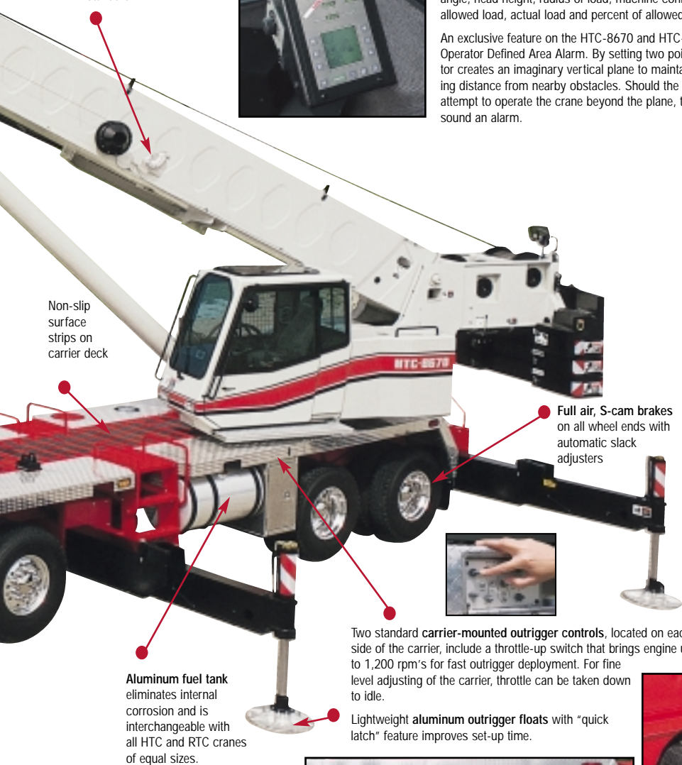
Non-slip surface strips on carrier deck