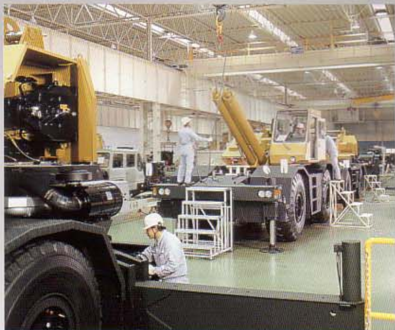
Many machines, few workers: Tadano's vast, clean and well-lit plants feature a wide range of automated equipment. At the newly expanded Shido plant, only about 400 employees, working singly or in pairs, are needed to produce over 2,500 large cranes a year.

Reliability is the first criterion of quality for cranes and other large-scale construction machinery. At Tadano's vast manufacturing facilities, extensive automation is backed by stringent quality control to ensure safety, speed and precision during every phase of the production process - and total product reliability thereafter.