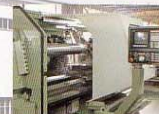
Quality through and through: Backed by highly specialized technologies, Tadano is becoming increasingly self-reliant in the production of cylinders and other key parts and equipment for its cranes.