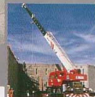
A study in versatility: Tadano cranes lend a helping hand in bold new development projects as well as in meticulous maintenance operations on historical landmarks.