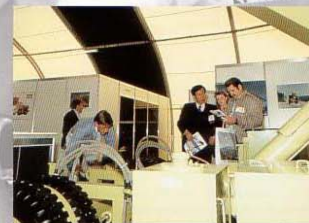
Regular participation in such major trade expositions as CONEXPO in Las Vegas is helping to make Tadano a familiar name in the United States and around the world.