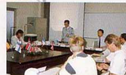
A philosophy of total servicing: When Tadano delivers a crane or related vehicle, it delivers not just a machine but, with it, a package of services including detailed advice to operators. (Above and left:) Distributors from all over the world gather for intensive training at Tadano's head office and facilities on the ins and outs of crane operation, maintenance and parts supply.