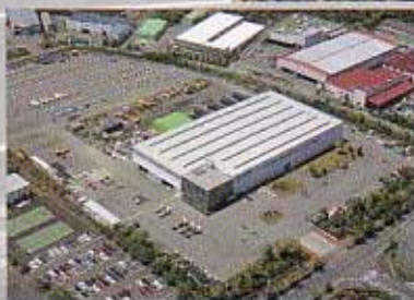
Three production facilities in Japan (clockwise from top): The Takamatsu plant, Shido plant, and Sakura plant.