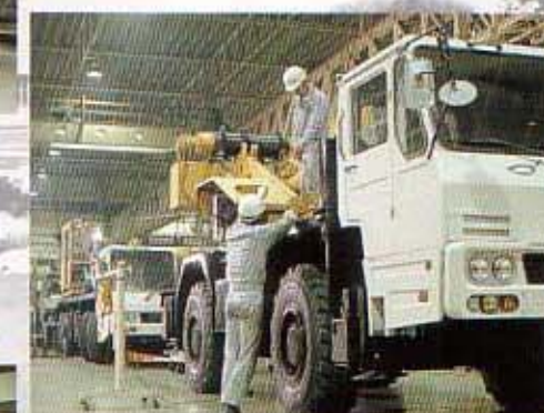
From our smallest truck loaders to our largest 360-ton-capacity cranes, no product is too unwieldy to be assembled on Tadano's advanced, fully integrated production lines.