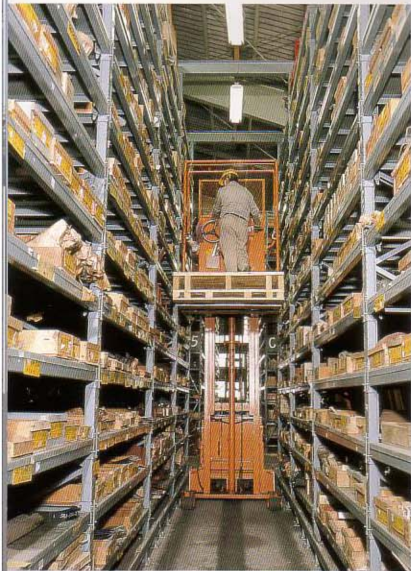
Good communication and efficient parts distribution are the cornerstones of Tadano's service policy. At the vast Takamatsu warehouse (above), over 38,000 parts are kept in stock and ready for prompt delivery nationwide.

Tadano exported its first hydraulic crane more than thirty years ago. We have been expanding our network ever since, adding new reach to our sales and technical support services, and linking up with new partners to meet the diverse needs of our global clientele. Now, more than ever, Tadano is a company on the move.