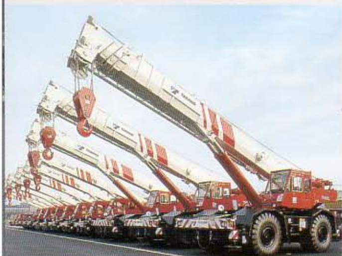
Lined up and ready to go: Sleek new cranes wait outside a Tadano plant to be loaded onto freighters bound for overseas.

Ever since Tadano introduced Japan's first hydraulic crane in 1955, it has continued to explore the outer reaches of hydraulic and mechatronic technologies to enhance and expand its fleet. Today, Tadano cranes are equally at home in the city as they are in the open country. They serve with efficiency and reliability in both urban development projects and on remote rural construction sites. And everywhere, they perform a wide range of lifting, transporting, maintenance and repair operations, providing indispensable tools for industries all over the world.